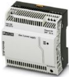
DIN rail power supply unit 24 V DC/3.5 A, primary switched-mode, 1-phase.

Please be informed that the data shown in this PDF Document is generated from our Online Catalog. Please find the complete data in the user's documentation. Our General Terms of Use for Downloads are valid ( http://phoenixcontact.com/download )