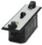
CHECKMASTER 2 test adapter for the TTC product range.

Test device adapter - CM 2-PA-TTC - 2908707