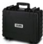
Transport case for accommodating 4 TRABTECH CM 2-PA... test adapters