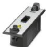
CHECKMASTER 2 test adapter for the VAL-MS product range

Test device adapter - CM 2-PA-VAL-MS - 2905265