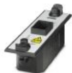
CHECKMASTER 2 test adapter for the FLT-CP, FLT-SEC, VAL-CP, and VAL-SEC product ranges

Test device adapter - CM 2-PA-FLT/VAL-CP/SEC - 2905283