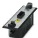
CHECKMASTER 2 test adapter for the PLT-SEC...UT/PT product ranges, 17.5 mm

Test device adapter - CM 2-PA-PLT-UT/PT - 1027866