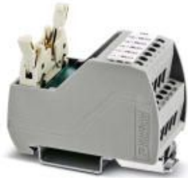
VARIOFACE Professional (VIP) board for the ROC800 controller

Please be informed that the data shown in this PDF Document is generated from our Online Catalog. Please find the complete data in the user's documentation. Our General Terms of Use for Downloads are valid ( http://phoenixcontact.com/download )