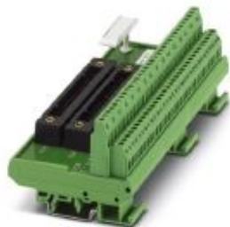
VARIOFACE interface module with screw connection, for Yokogawa RTD module AAR145.

Please be informed that the data shown in this PDF Document is generated from our Online Catalog. Please find the complete data in the user's documentation. Our General Terms of Use for Downloads are valid ( http://phoenixcontact.com/download )