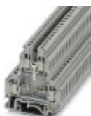
Double-level terminal block, with preassembled resistors

Component terminal block - UKK 5-2R/NAMUR - 2941662