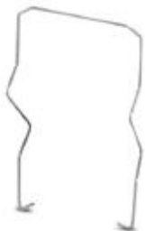
Relay retaining bracket, wire model, suitable for RIF-4 relay base

Please be informed that the data shown in this PDF Document is generated from our Online Catalog. Please find the complete data in the user's documentation. Our General Terms of Use for Downloads are valid ( http://phoenixcontact.com/download )