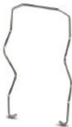
Relay retaining bracket, wire model, suitable for RIF-2 relay base

Please be informed that the data shown in this PDF Document is generated from our Online Catalog. Please find the complete data in the user's documentation. Our General Terms of Use for Downloads are valid ( http://phoenixcontact.com/download )