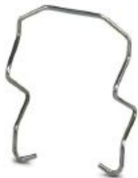
Relay retaining bracket, wire model, suitable for RIF-1 relay base, for 16 mm high octal miniature power and solid-state relays

Please be informed that the data shown in this PDF Document is generated from our Online Catalog. Please find the complete data in the user's documentation. Our General Terms of Use for Downloads are valid ( http://phoenixcontact.com/download )