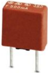
Plug-in fuse (TE5 ® ); nominal current: 2 A; tripping behavior: fast-blow (F)

Please be informed that the data shown in this PDF Document is generated from our Online Catalog. Please find the complete data in the user's documentation. Our General Terms of Use for Downloads are valid ( http://phoenixcontact.com/download )