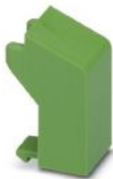
DIN rail housing, Filler plug for unoccupied terminal points, color: green (6021)

Please be informed that the data shown in this PDF Document is generated from our Online Catalog. Please find the complete data in the user's documentation. Our General Terms of Use for Downloads are valid ( http://phoenixcontact.com/download )