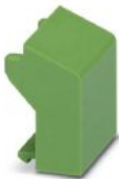
DIN rail housing, Filler plug for unoccupied terminal points, color: green (6021)

Please be informed that the data shown in this PDF Document is generated from our Online Catalog. Please find the complete data in the user's documentation. Our General Terms of Use for Downloads are valid ( http://phoenixcontact.com/download )