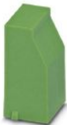
DIN rail housing, Filler plug for unoccupied terminal points, color: green (6021)

Please be informed that the data shown in this PDF Document is generated from our Online Catalog. Please find the complete data in the user's documentation. Our General Terms of Use for Downloads are valid ( http://phoenixcontact.com/download )