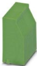
DIN rail housing, Filler plug for unoccupied terminal points, color: green (6021)

Please be informed that the data shown in this PDF Document is generated from our Online Catalog. Please find the complete data in the user's documentation. Our General Terms of Use for Downloads are valid ( http://phoenixcontact.com/download )