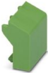
DIN rail housing, Filler plug for unoccupied terminal points, color: green (6021)

Please be informed that the data shown in this PDF Document is generated from our Online Catalog. Please find the complete data in the user's documentation. Our General Terms of Use for Downloads are valid ( http://phoenixcontact.com/download )