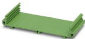
The figure shows the variant UM 45-Profil CM

Panel mounting base, open, Lower part, Cross connection: without bus connector, color: green, width: 1000 mm, number of positions cross connector: not relevant, Note: required profile length = PCB length - 3.6 mm