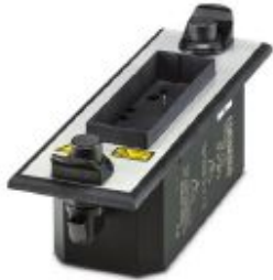
CHECKMASTER 2 test adapter for the FLT-SEC-H product range.

Please be informed that the data shown in this PDF Document is generated from our Online Catalog. Please find the complete data in the user's documentation. Our General Terms of Use for Downloads are valid ( http://phoenixcontact.com/download )