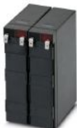
Replacement battery for UPS-BAT/VRLA... energy storage

Please be informed that the data shown in this PDF Document is generated from our Online Catalog. Please find the complete data in the user's documentation. Our General Terms of Use for Downloads are valid ( http://phoenixcontact.com/download )