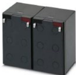
Replacement battery for UPS-BAT/VRLA... energy storage

Please be informed that the data shown in this PDF Document is generated from our Online Catalog. Please find the complete data in the user's documentation. Our General Terms of Use for Downloads are valid ( http://phoenixcontact.com/download )