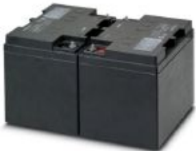
Replacement battery for UPS-BAT/VRLA... energy storage

Please be informed that the data shown in this PDF Document is generated from our Online Catalog. Please find the complete data in the user's documentation. Our General Terms of Use for Downloads are valid ( http://phoenixcontact.com/download )