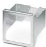
DIN rail adapter for EEM-MA770-X and EEM-MA771-X series energy measuring devices

DIN rail adapter - EEM-MKT-DRA - 2902078