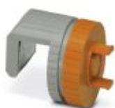
The optional holding device ensures the Rogowski coil is securely seated on busbars with a thickness of 10 ... 15 mm. During installation, the coil housing is pushed onto the flange of the holding device and snaps in automatically.