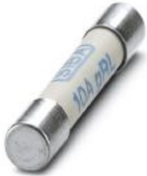
Fuse, nominal current: 10 A, length: 31.8 mm, diameter: 6.35 mm

Please be informed that the data shown in this PDF Document is generated from our Online Catalog. Please find the complete data in the user's documentation. Our General Terms of Use for Downloads are valid ( http://phoenixcontact.com/download )