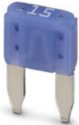
Fuse, nominal current: 15 A, length: 11.9 mm, width: 3.8 mm, height: 16.2 mm

Please be informed that the data shown in this PDF Document is generated from our Online Catalog. Please find the complete data in the user's documentation. Our General Terms of Use for Downloads are valid ( http://phoenixcontact.com/download )