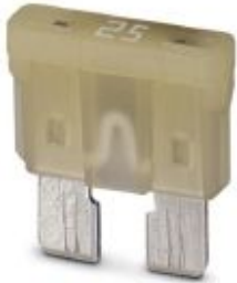
Fuse, nominal current: 25 A, length: 19 mm, width: 5 mm, height: 19.7 mm

Please be informed that the data shown in this PDF Document is generated from our Online Catalog. Please find the complete data in the user's documentation. Our General Terms of Use for Downloads are valid ( http://phoenixcontact.com/download )