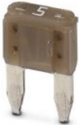
Fuse, nominal current: 5 A, length: 11.9 mm, width: 3.8 mm, height: 16.2 mm

Please be informed that the data shown in this PDF Document is generated from our Online Catalog. Please find the complete data in the user's documentation. Our General Terms of Use for Downloads are valid ( http://phoenixcontact.com/download )