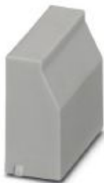
DIN rail housing, Filler plug for unoccupied terminal points, color: light gray (7035)

Please be informed that the data shown in this PDF Document is generated from our Online Catalog. Please find the complete data in the user's documentation. Our General Terms of Use for Downloads are valid ( http://phoenixcontact.com/download )