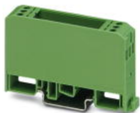
Electronic housing, with universal foot, for PCB insertion, without screw connection terminal blocks and cover

Please be informed that the data shown in this PDF Document is generated from our Online Catalog. Please find the complete data in the user's documentation. Our General Terms of Use for Downloads are valid ( http://phoenixcontact.com/download )