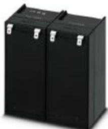
Replacement battery for UPS-BAT/VRLA... energy storage

Please be informed that the data shown in this PDF Document is generated from our Online Catalog. Please find the complete data in the user's documentation. Our General Terms of Use for Downloads are valid ( http://phoenixcontact.com/download )