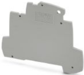
End cover for terminating a row of TERMITRAB complete TTC-6... terminal blocks

Please be informed that the data shown in this PDF Document is generated from our Online Catalog. Please find the complete data in the user's documentation. Our General Terms of Use for Downloads are valid ( http://phoenixcontact.com/download )