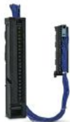
Migration adapter for converting Allen Bradley PLC-5 (1771-WH) to Siemens SIMATIC® S7-1500 front connector. 1771-IAD to 6ES7 521-1FH00-0AA0 conversion, cable length: 0.5 m

Please be informed that the data shown in this PDF Document is generated from our Online Catalog. Please find the complete data in the user's documentation. Our General Terms of Use for Downloads are valid ( http://phoenixcontact.com/download )