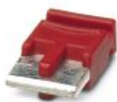
Single plug-in bridge, length: 6 mm, number of positions: 2, color: red

Single plug-in bridge - FBST 6-PLC RD - 2966236