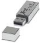
USB memory stick, 8 GB

USB memory stick - USB FLASH DRIVE - 2402809