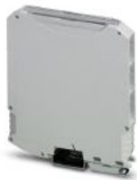
DIN rail housing, Complete housing with metal foot catch, tall design, without vents, width: 12.5 mm, height: 99 mm, depth: 114.5 mm, color: light gray (7035)

Please be informed that the data shown in this PDF Document is generated from our Online Catalog. Please find the complete data in the user's documentation. Our General Terms of Use for Downloads are valid ( http://phoenixcontact.com/download )