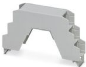
DIN rail housing, Upper housing part for connectors with header, width: 22.6 mm, height: 102 mm, depth: 60.15 mm, color: light gray (7035)

Please be informed that the data shown in this PDF Document is generated from our Online Catalog. Please find the complete data in the user's documentation. Our General Terms of Use for Downloads are valid ( http://phoenixcontact.com/download )