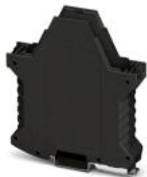
Component housing, length: 99 mm, Lower part, color: black, width: 22.5 mm, height: 114.5 mm

Please be informed that the data shown in this PDF Document is generated from our Online Catalog. Please find the complete data in the user's documentation. Our General Terms of Use for Downloads are valid ( http://phoenixcontact.com/download )