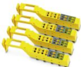
Connector set (yellow), color coded, for safe SDO boards.

Please be informed that the data shown in this PDF Document is generated from our Online Catalog. Please find the complete data in the user's documentation. Our General Terms of Use for Downloads are valid ( http://phoenixcontact.com/download )