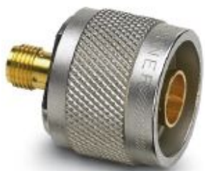
Antenna adapter, frequency range: 0.3 GHz ... 6 GHz, connection: N (male) -> SMA (female)

Please be informed that the data shown in this PDF Document is generated from our Online Catalog. Please find the complete data in the user's documentation. Our General Terms of Use for Downloads are valid ( http://phoenixcontact.com/download )