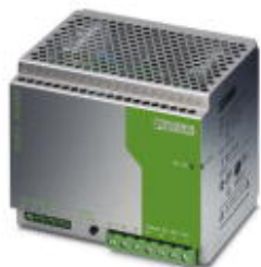
DIN rail power supply, 48 V DC/10 A, primary-switched, 3-phase

Please be informed that the data shown in this PDF Document is generated from our Online Catalog. Please find the complete data in the user's documentation. Our General Terms of Use for Downloads are valid ( http://phoenixcontact.com/download )