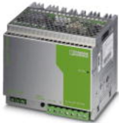
DIN rail power supply unit, primary-switched mode, 1-phase, output: 48 V DC / 10 A

Please be informed that the data shown in this PDF Document is generated from our Online Catalog. Please find the complete data in the user's documentation. Our General Terms of Use for Downloads are valid ( http://phoenixcontact.com/download )