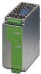
DIN rail power supply unit 24 V DC/5 A, primary switched-mode, 1-phase.

Please be informed that the data shown in this PDF Document is generated from our Online Catalog. Please find the complete data in the user's documentation. Our General Terms of Use for Downloads are valid ( http://phoenixcontact.com/download )