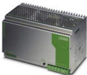
DIN rail power supply unit 24 V DC/30 A, primary switched-mode, 3-phase.

Please be informed that the data shown in this PDF Document is generated from our Online Catalog. Please find the complete data in the user's documentation. Our General Terms of Use for Downloads are valid ( http://phoenixcontact.com/download )