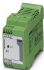
Primary-switched MINI POWER power supply for DIN rail mounting, input: 1-phase, output: 24 V DC/2 A

Please be informed that the data shown in this PDF Document is generated from our Online Catalog. Please find the complete data in the user's documentation. Our General Terms of Use for Downloads are valid ( http://phoenixcontact.com/download )