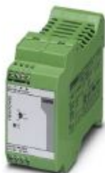
Primary-switched MINI POWER power supply for DIN rail mounting, input: 1-phase, output: 10 V DC ... 15 V DC/2 A

Please be informed that the data shown in this PDF Document is generated from our Online Catalog. Please find the complete data in the user's documentation. Our General Terms of Use for Downloads are valid ( http://phoenixcontact.com/download )