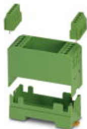
Electronic housing set, consisting of electronic housing and printed circuit termination blocks, pitch 5

Please be informed that the data shown in this PDF Document is generated from our Online Catalog. Please find the complete data in the user's documentation. Our General Terms of Use for Downloads are valid ( http://phoenixcontact.com/download )