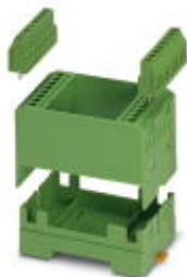
Electronic housing set, consisting of electronic module and printed circuit termination blocks, pitch 5

Please be informed that the data shown in this PDF Document is generated from our Online Catalog. Please find the complete data in the user's documentation. Our General Terms of Use for Downloads are valid ( http://phoenixcontact.com/download )