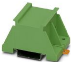
Mounting plate for screwing on switchgear, high-profile version

Please be informed that the data shown in this PDF Document is generated from our Online Catalog. Please find the complete data in the user's documentation. Our General Terms of Use for Downloads are valid ( http://phoenixcontact.com/download )