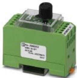
Setpoint value potentiometer, to set setpoints individually, resistance value 4,7 kΩ

Please be informed that the data shown in this PDF Document is generated from our Online Catalog. Please find the complete data in the user's documentation. Our General Terms of Use for Downloads are valid ( http://phoenixcontact.com/download )