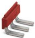
Insertion bridge, pitch: 6.15 mm, number of positions: 3, color: red

Insertion bridge - EB 3- DIK RD - 2716745