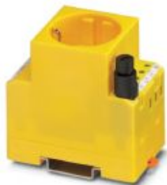
Rail-mountable socket, with glow lamp and equipment fusing 5 x 20 mm to max. 6.3 A; yellow housing

Please be informed that the data shown in this PDF Document is generated from our Online Catalog. Please find the complete data in the user's documentation. Our General Terms of Use for Downloads are valid ( http://phoenixcontact.com/download )