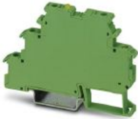
Power solid-state relay terminal block, input: 5 V DC, output: 3 - 30 V DC/3 A, terminal block width: 6.2 mm

Please be informed that the data shown in this PDF Document is generated from our Online Catalog. Please find the complete data in the user's documentation. Our General Terms of Use for Downloads are valid ( http://phoenixcontact.com/download )