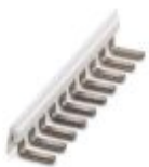
Insertion bridge, pitch: 6.15 mm, number of positions: 80, color: white

Insertion bridge - EB 80- DIK WH - 2715788